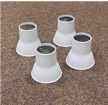
Elephants feet: (suitable for raising a single bed or a chair)