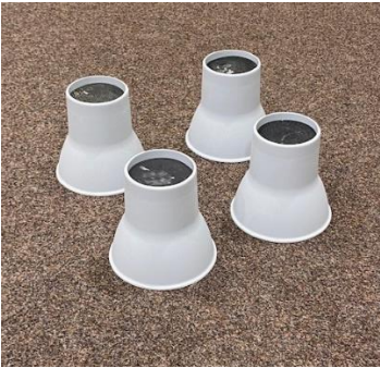
Elephants feet: (suitable for raising a single bed or a chair)