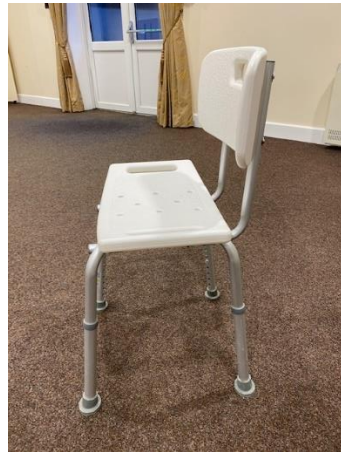
Shower stool 2