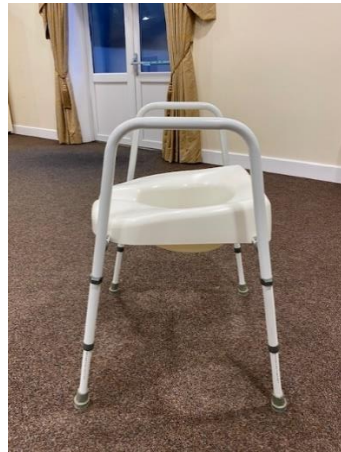
Toilet seat riser