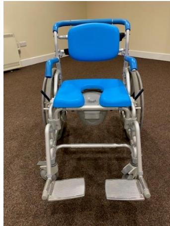
Shower commode (only suitable for use at Pendennis)