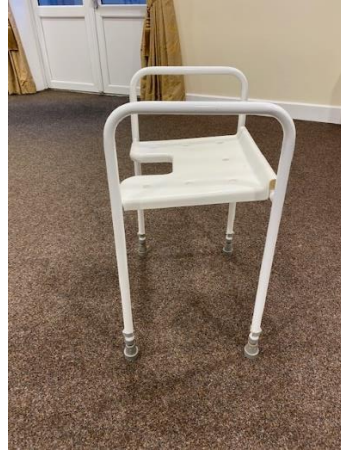
Shower stool 1